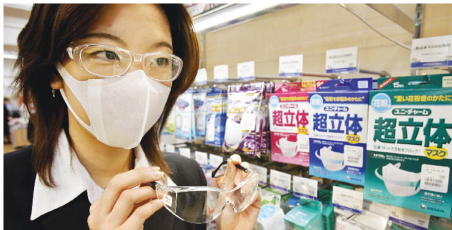
Masks and goggles are the order of the day as Japan struggles to cope with a rise in hay fever.

Various environmental causes have been suggested for the increase in allergic diseases, including changes in diet, poorly ventilated housing, increased exposure to allergens, air pollution (commonly believed by patients to be important) and, most convincingly, reduced infections during early childhood, which favours an allergic pattern of immunity. No single factor accounts for the rise, however, which is likely to be caused by a combination of environmental factors that occur together in Western society. Asthma, allergic rhinitis (including hay fever) and eczema have all increased, suggesting that they have an underlying allergic mechanism. Many epidemiological studies have now been done, but it is still not known exactly which environmental