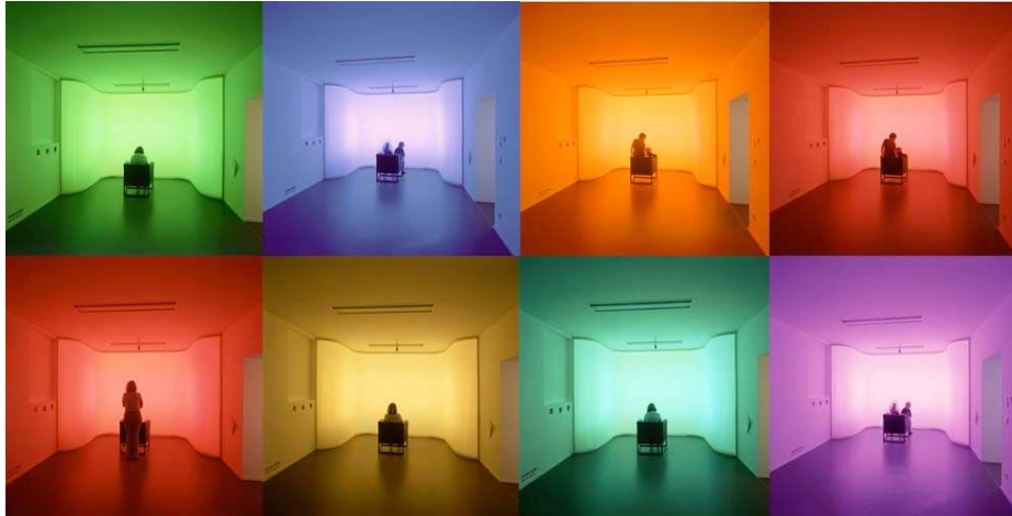
Fig. 1. Different colors generated in response to various seating positions.