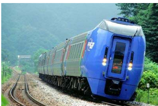
Figure 2: A Japanese tilting train

Magnetic levitation (MAGLEV) technology was first tested in the 1970s, but it has never been in commercial operation on long-distance routes. The technology relies on electromagnetic forces to cause the vehicle to hover above the track and move forward. In practice, the aim is for an operation speed of 500 km/h. In 2003, a MAGLEV test train achieved a world record speed of 581 km/h. The special infrastructure required for MAGLEV trains means high construction costs and no compatibility with the railway network. The MAGLEV is mostly associated with countries like Japan (Figure 3) and Germany, where MAGLEV test lines are in operation. In China, a short MAGLEV line was opened in December 2003 connecting Shanghai Airport and the Pudong a financial district in Shanghai, with trains running at maximum speed of 430 km/h.