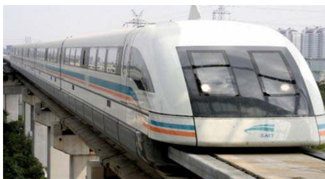
Figure 3: A Japanies Maglev train