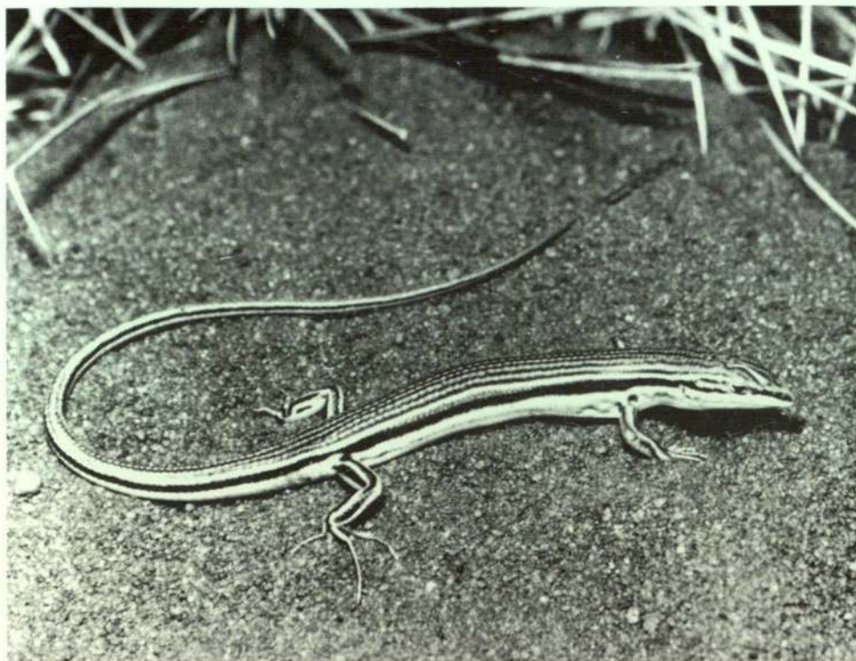
Plate 2: Holotype of Ctenotus colletti rufescens photographed in life by T.M.S. Hanlon.