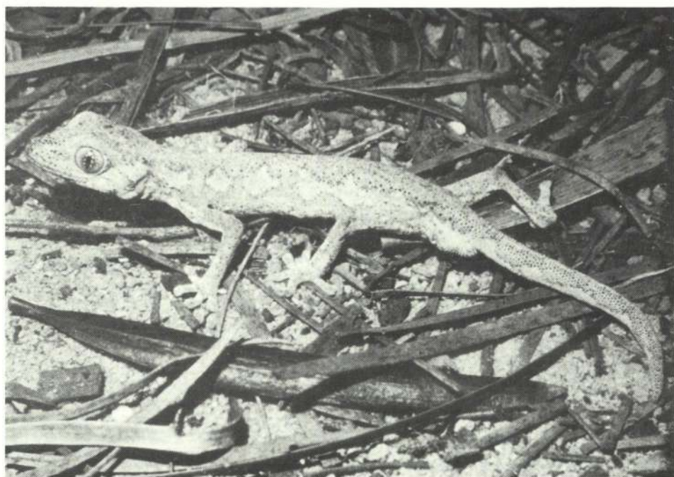
Plate 1: Holotype of Diplodactylus rankini photographed in life by G. Harold.

Upper west coast of Western Australia. Active at night in trees and shrubs on white coastal dunes.