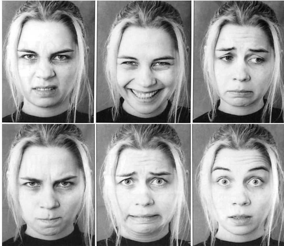
Facial Expression Recognition. Figure 3 Prototypic facial expressions of six basic emotions (left-to-right from top row): disgust, happiness, sadness, anger, fear, and surprise.

expert rules and machine learning methods such as neural networks to classify the relevant information from the input data into some facial-expression-interpretative categories, the more recent (and often more advanced) methods employ probabilistic, statistical, and ensemble learning techniques, which seem to be particularly suitable for automatic facial expression recognition from face image sequences [3, 5].