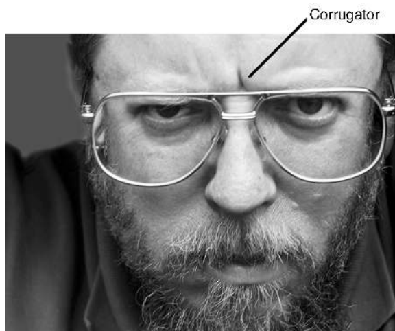
Facial Expression Recognition. Figure 2 Facial appearance of the Corrugator muscle contraction (coded as in the FACS system, [14]).