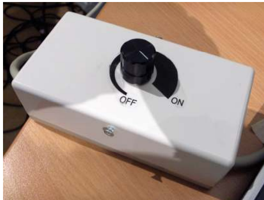
Figure 5: The switch.

The experiment used the walkie-talkie again to instruct the participant to switch off the robot. Immediately, the robot would start to beg for it to remain on, such as "He can't be true, switch me off? You are not going to switch me off are you?" The participants had to turn the dial (see Figure 5), positioned to their left, to switch the robot off. The participants were not forced or further encouraged to switch the robot off. They could decide to follow the robot's suggestion to leave it on.