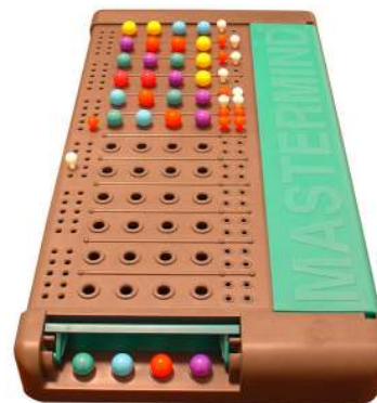
Figure 2: The original Mastermind game

This cooperative game allowed the participant to evaluate the quality of the robots suggestion. It also allowed the participant to experience the robot's personality. In the high agreeableness condition, for example, the robot would kindly ask if it could make a suggestion, whereas in the low agreeableness condition, it would insist that it is its turn.