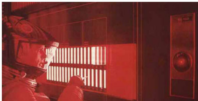
Figure 1: Dave Bowman removes HAL's memory modules.

The question if Bowman committed murder, although in self-defense, or simply conducted a necessary maintenance act, is an essential topic in the field of robot ethics. First of all, it depends on the definition of what constitutes life. HAL is certainly a higher-order intentional system [3] that can be described as being conscious. Arguments against HAL's animacy include the fact that HAL is not a biological organism and that it is not known if it grows or reproduces. There is no generally accepted definition of what life is and therefore the discussion if HAL is alive cannot be concluded. The second ethical controversy concerns HAL's responsibility for the events on the Discovery XD-1 space ship. Is HAL responsible for its acts, such as almost killing the whole crew? Or are the programmers' of HAL to blame?