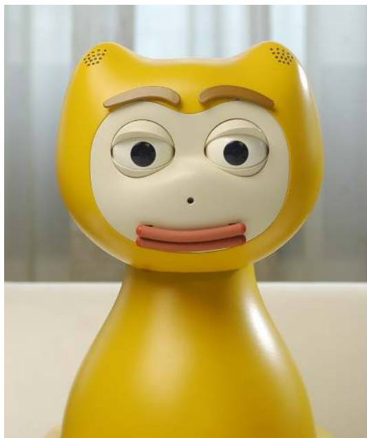
Figure 3: The iCat robot

expressions, such as happiness, surprise, anger or sadness, that are essential in creating social human-robot interaction dialogues. A speaker and soundcard are included to play sounds and speech. Finally, touch sensors and multi-color LEDs are installed in the feet and ears to sense whether the user touches the robot and to communicate further information encoded by colored light. If the iCat, for example, told the participant to pick a color in the Mastermind game, then it would show the same color in its ears.